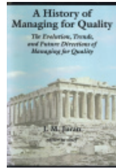
J.M. Juran, editor in chief, 1995, ASQ Press Hardcover, e-book

together according to the master plan in the great pyramids at Giza. These quality